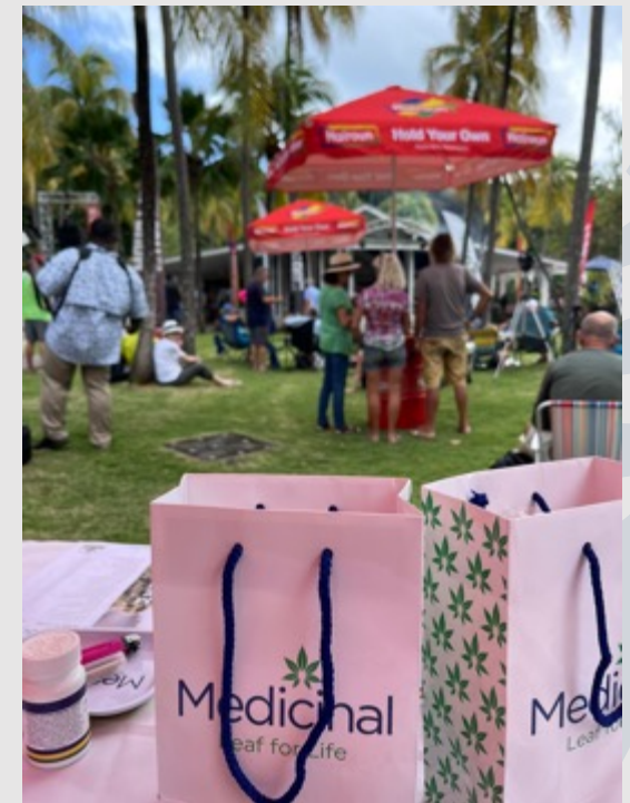
Bequia Music Festival