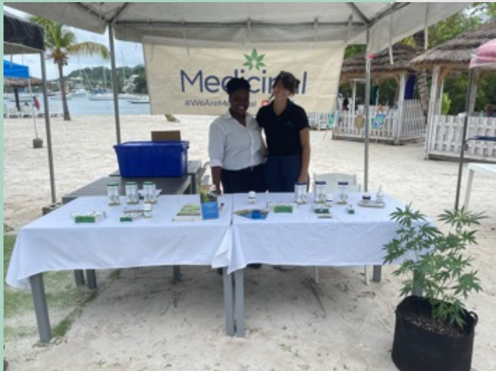
Pop Up Market at Coconut Grove