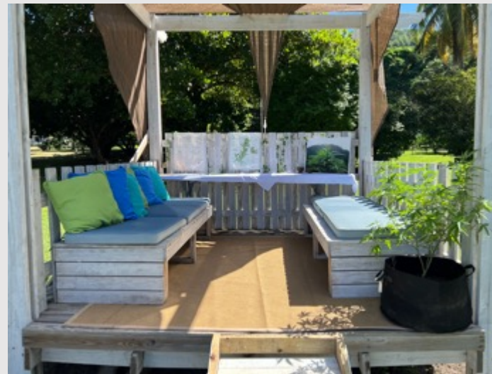
Pop Up Market at Plantation House