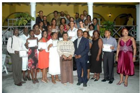
Graduates, Coordinators and Guests St. Vincent and the Grenadines

I wish you all the best in your future endeavors. Thank you and goodnight.