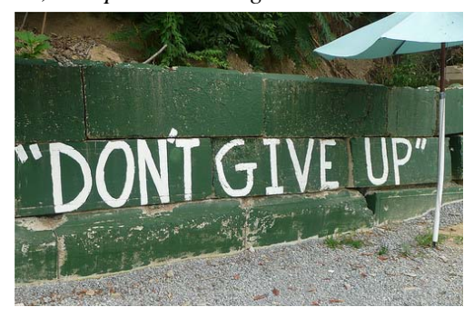
to do that ..., but life keeps getting in the way".

A focused disciplined and approach to consistent savings and investing over the long-term. Having the discipline to stick to a long-term financial plan is always a challenge for many of us. We start off with a lot of steam but burn out somewhere in the middle and stop contributing to our savings and investment plans. Not surprisingly though, when we get advice on how to get back on the path of financial success, we are quick to state, I used