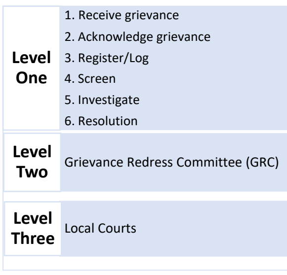
Figure 10.1: Project GRM

The project will establish a grievance redress mechanism (GRM) that is in alignment with the requirements of ESS10-Stakeholder Engagement. This GRM will be established early in project development to ensure that all complaints are adequately recorded and responded to. The project Stakeholder Engagement Plan (SEP) details the grievance procedure that has been established for the project. While the RPF utilizes the same GRM as the project's, any complaints filled by Project Affected Persons (PAPs) in relation to resettlement, shall be logged and filed differently to those received from other project stakeholders. The basic steps involved in the project GRM are outlined in Figure 10.1.